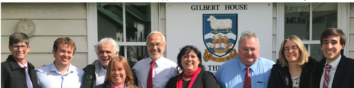
MLAs meet with the Uruguayan Parliamentarians

On other matters, the Budget process continues, with long days spent looking at requests from departments for more staff or money to develop services. Whilst we want to be as helpful as possible, we will be unable to agree to all posts, especially if they are to be recruited from overseas and need a house. We are continuing to build houses as quickly as we can, with FIC soon to start work on 18 on phase 5 of Sapper Hill and plans now in the final stage for the development of phase 6.