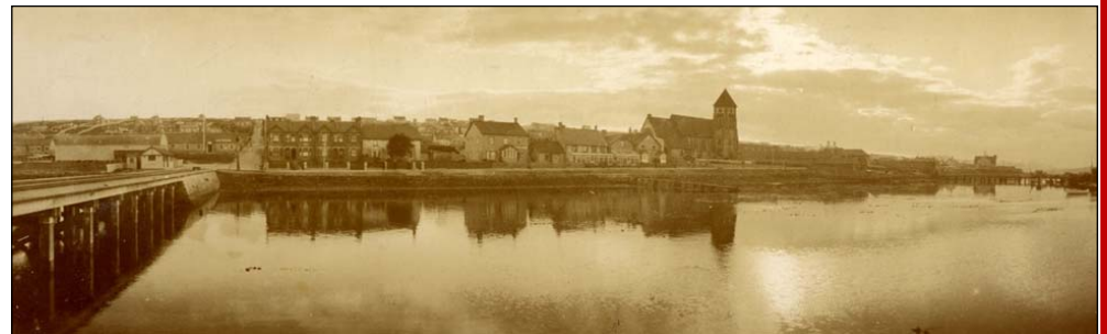
Stanley — 1870s

By Order-in-Council dated 2 September 1964 the constitution was altered to allow for a clear unofficial majority by reducing the number of ex-officio members from three to two. Of significance was the wording of the Order which changed the description of nominated members from "Unofficial" to "Independent" reflecting the growing acknowledgement of the democratic process, endorsed by Governor Arrowsmith's address to Legislative Council shortly before the new Constitution came in place "Nominated members were in no sense 'Government Men' and were as independent in their views and the way they voted as elected members."