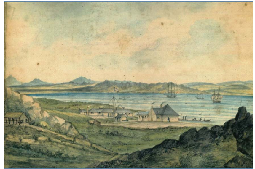
Government Offices and House circa 1845

It was a privilege to serve on the Government of these Islands during the greatest period of change in the history of the Falklands and I am pleased that our children have, I think, a bright future ahead of them and our people can look forward to an economically stable future. All we need to do now is ensure we protect our waters from pollution so that our wildlife will thrive as well!