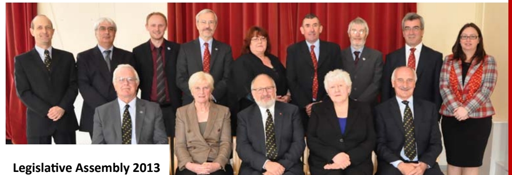
Legislative Assembly 2013

Initially, MLAs were not fulltime but in 2013 this was changed. MLAs began to receive a salary as it was deemed too much pressure was put upon those that were self-employed or that it deterred people from standing for Camp and Stanley as it would mean time off pay, employing someone to do your work for you, or using leave for legislative duties.