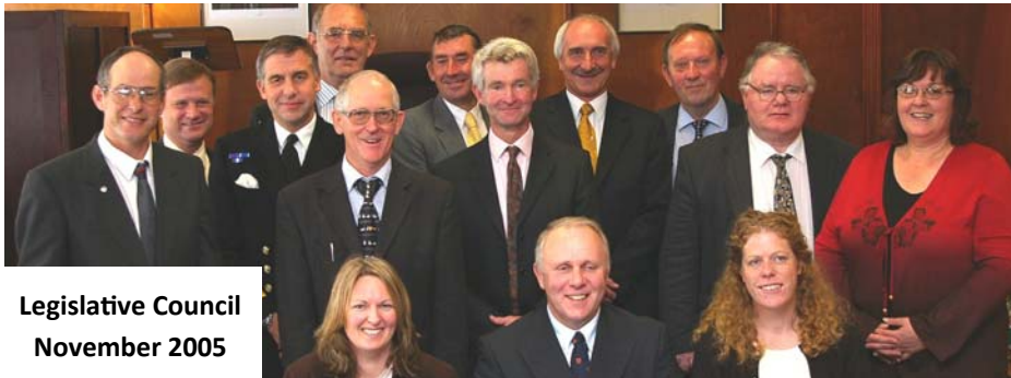
Legislative Council November 2005

Falkland Islands Constitution Order 2008